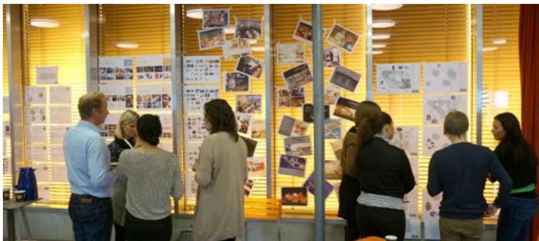
Case - information gallery wall

The main theme for the workshop was to develop solutions for shared spaces at the new national library that will be realised at Bjørvika in Oslo in 2017 (for more information see: http://blogg.deichman.no/nyedeichman/ ).