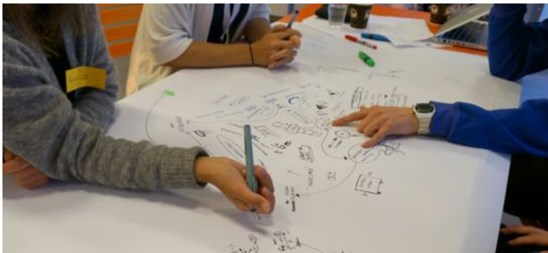
Group work - mapping task

All of the above themes where limited by a single factor due to predicted low library budgets: "The solution must be (as far as possible) self-generating and building on the actors and the audience's initiative and production"