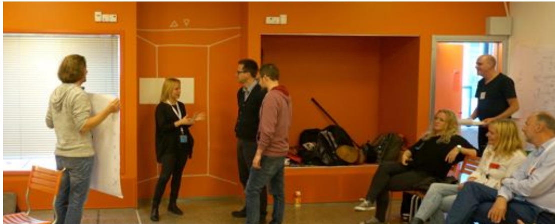
Presentations – short pitch

After two iterations of mapping each group created a sort pitch of a chosen idea or concept for external representatives from the library leader group. After the pitch presentations the participants were asked to vote for their favourite idea/concept.